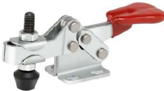
Model No. H-206-U