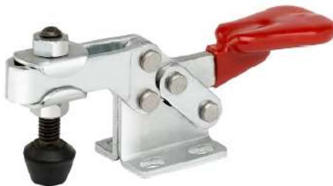
Model No. H-206-HU