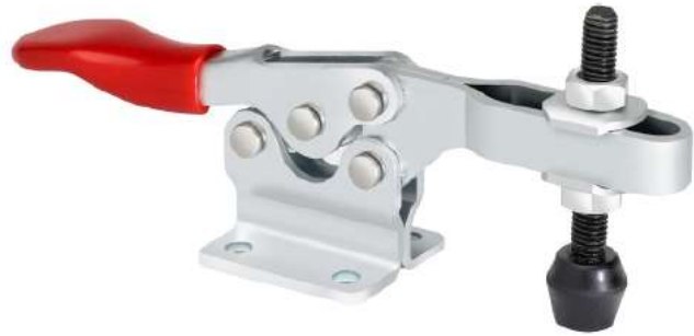
Model No. H-225-U