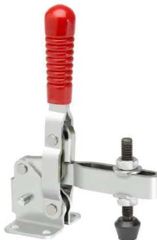
Model No. VTC-210-U

Also Available in Stainless Steel VTC-210-U-SS VTC-210-UB-SS