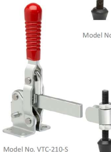
Model No. VTC-210-S