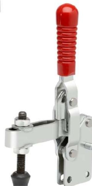
Model No. VTC-210-UB

Also Available in Stainless Steel VTC-210-U-SS VTC-210-UB-SS