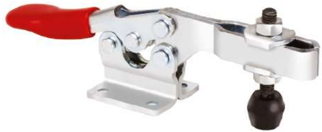
Model No. H-215-U