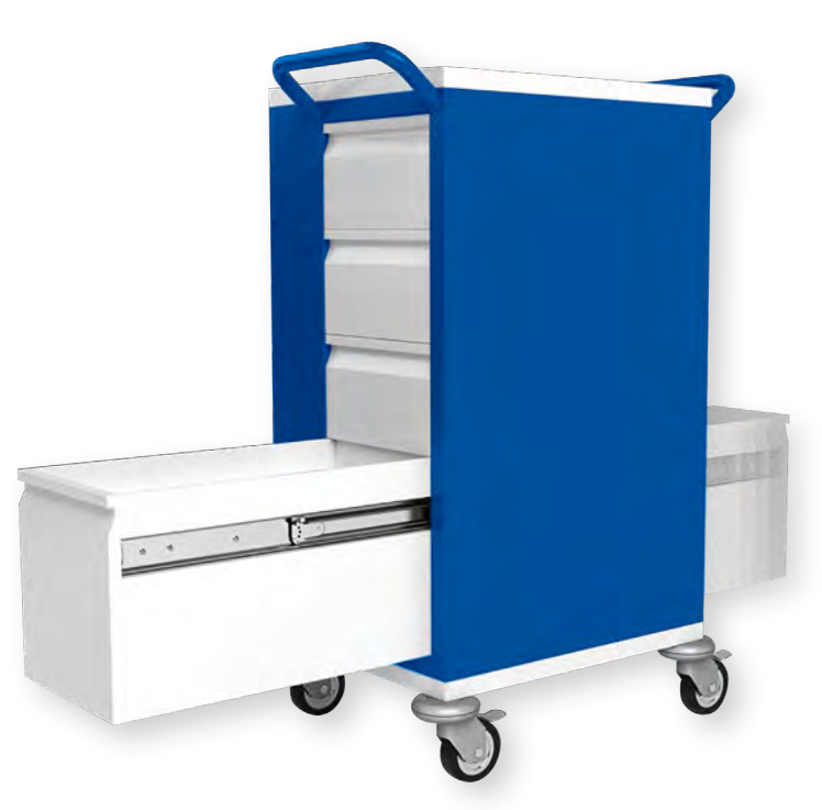
Expands access in mobile supply carts.