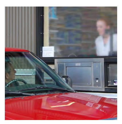
A good solution for partitioned indoor/outdoor access.