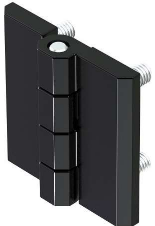
M6 镶嵌螺柱 With Threaded Studs M6