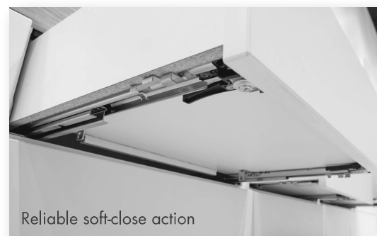
Reliable soft-close action

BHMA CERTIFIED Be Safe. Be Secure. Look for the Mark.