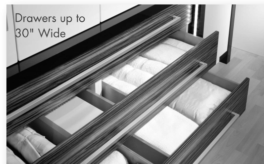
Drawers up to 30" Wide